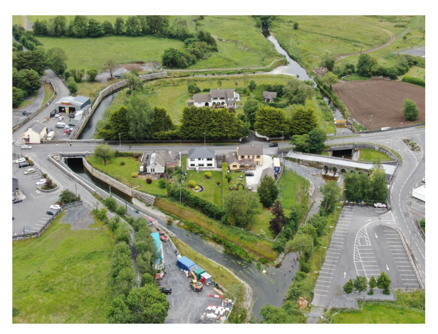
Figure 1: Completed Craughwell Village Bypass and River Deeping Works