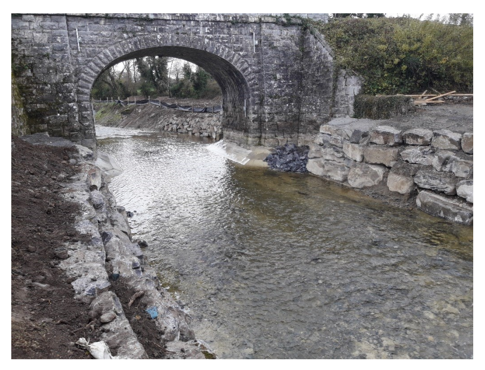
Figure 10: UB154 Railway Bridge

Construction of a concrete apron at each abutment to protect the bridge following deepening works is complete.