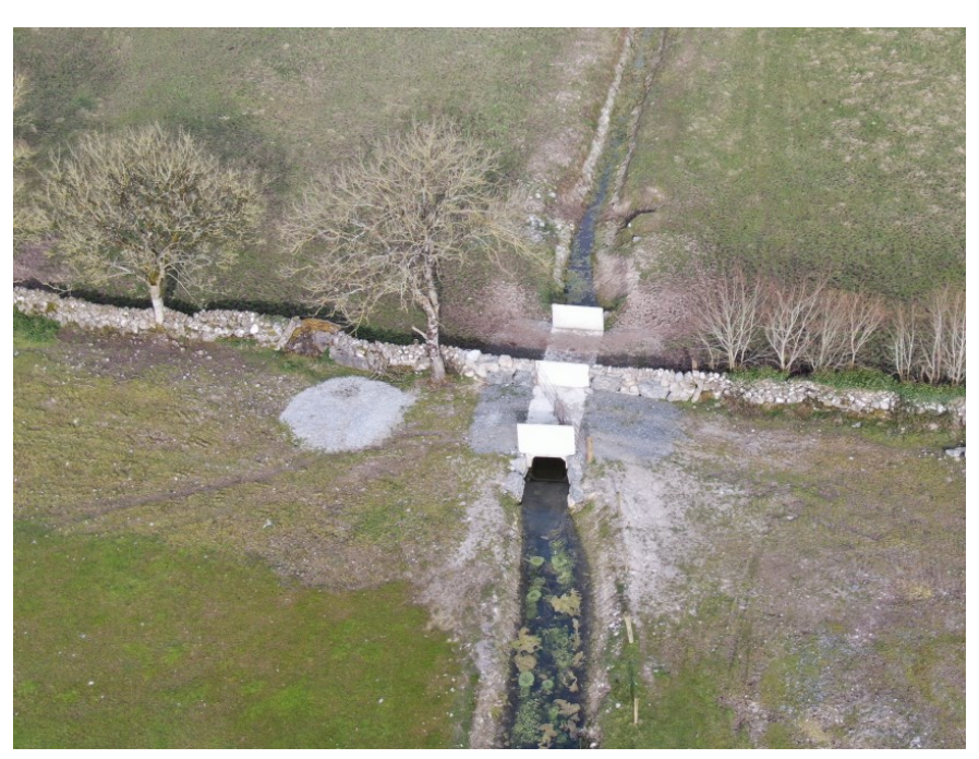
Figure 11: Aggard Culvert

Carry out channel maintenance and replacement of structures identified on the Aggard Stream.