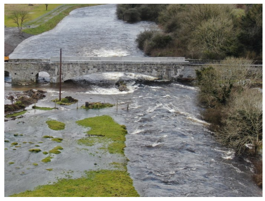
Figure 4: Flood Waters at New Dunkellin Bridge February 2020