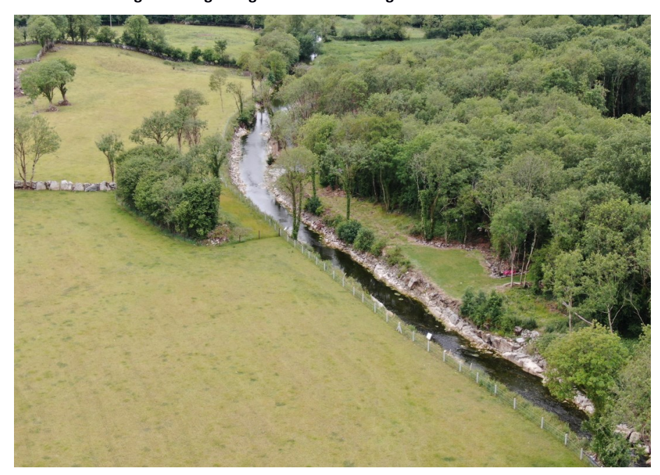
Figure 7: Reinstated Section of Dunkellin in June 2020, following Regrading Works