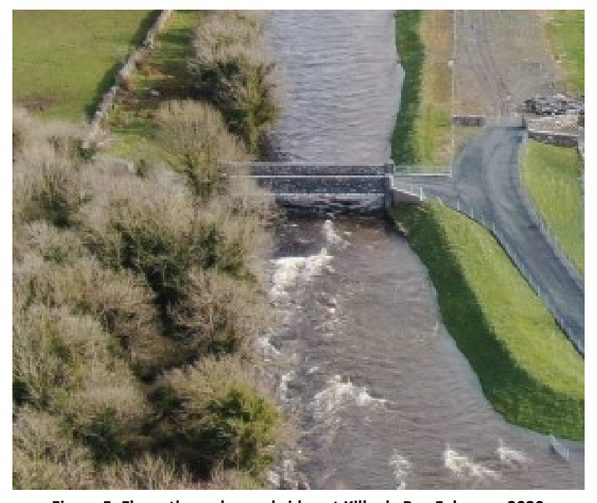
Figure 5: Flows through new bridge at Killeely Beg February 2020