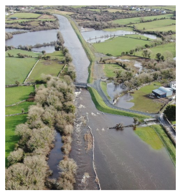
Figure 2: New Two Stage Channel from Dunkellin Bridge to Killeely Beg Bridge