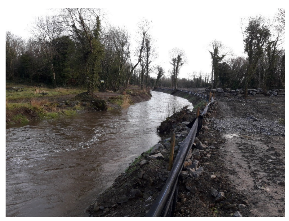
Figure 6: Regrading of Dunkellin during Construction in 2019

The re-grading of the Dunkellin River complete, Environmental River Enhancement works to be completed July/August 2020.