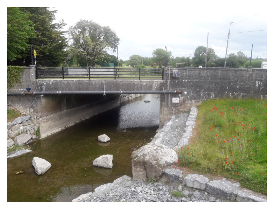
Figure 8: Regrading of Dunkellin complete

Construction of a concrete apron on the R446 Road Bridge complete.