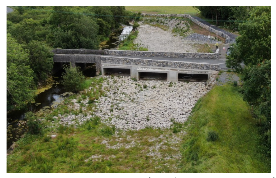
Figure 3: Completed Works at Rinn Bridge (3 new flood eyes on right hand side)

Status – Ongoing, to be completed October 2020